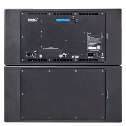
PMC8-2 SUB rear panel